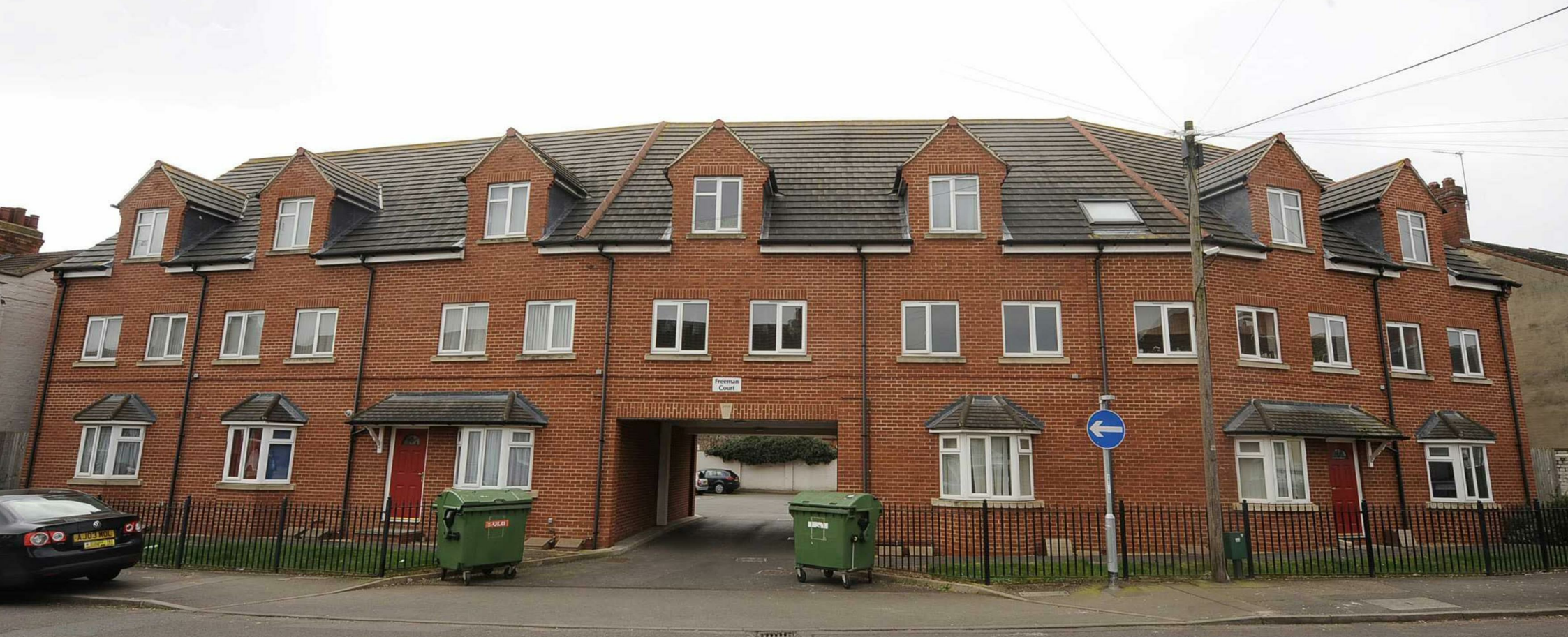
Photo Shows Whole Block From The Front

Flat 2 Stanley Road, Wellingborough, NN8 1BF